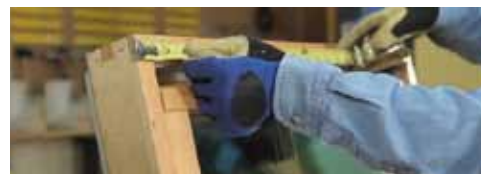
Custom Sizing to the 1/8"

Andersen has developed new windows that can help you save time and money on the job and win more work. Take a look at their new offerings below!