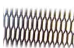
Galvanized Metal Lath