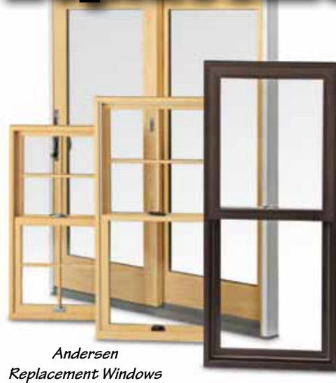
Andersen Replacement Windows