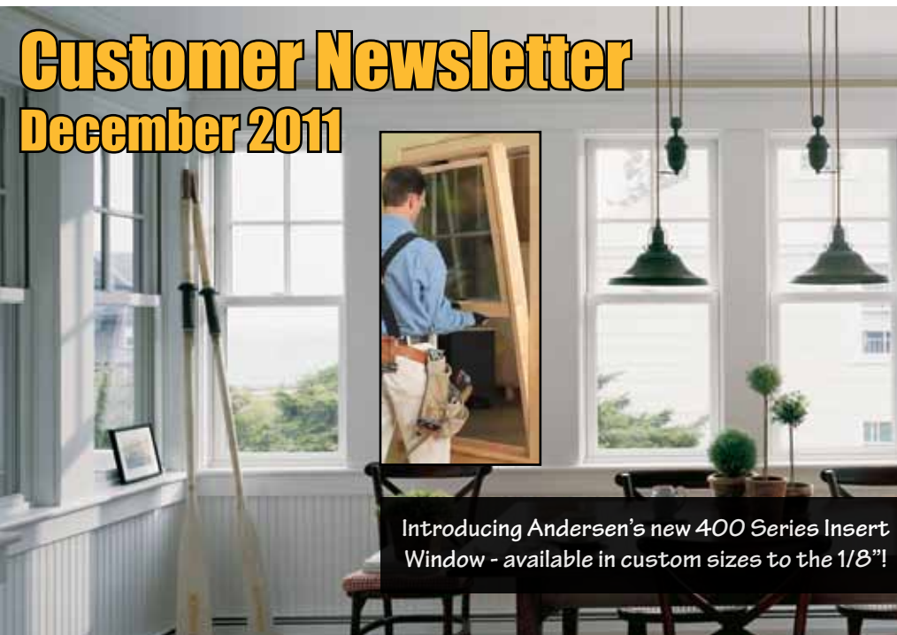
Introducing Andersen's new 400 Series Insert Window - available in custom sizes to the 1/8"!