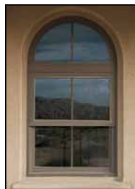
Andersen 100 Series Windows