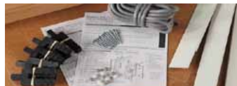
Install Kit included

Scan this QR code to watch the intro video on your smartphone or visit www.youtube.com/andersenwindow